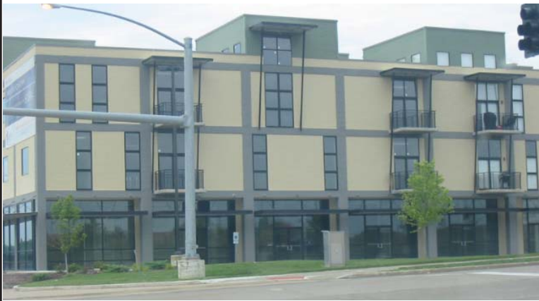
Unique buildings with residential lofts above.

1517 Cottleville Parkway Cottleville, MO 63376